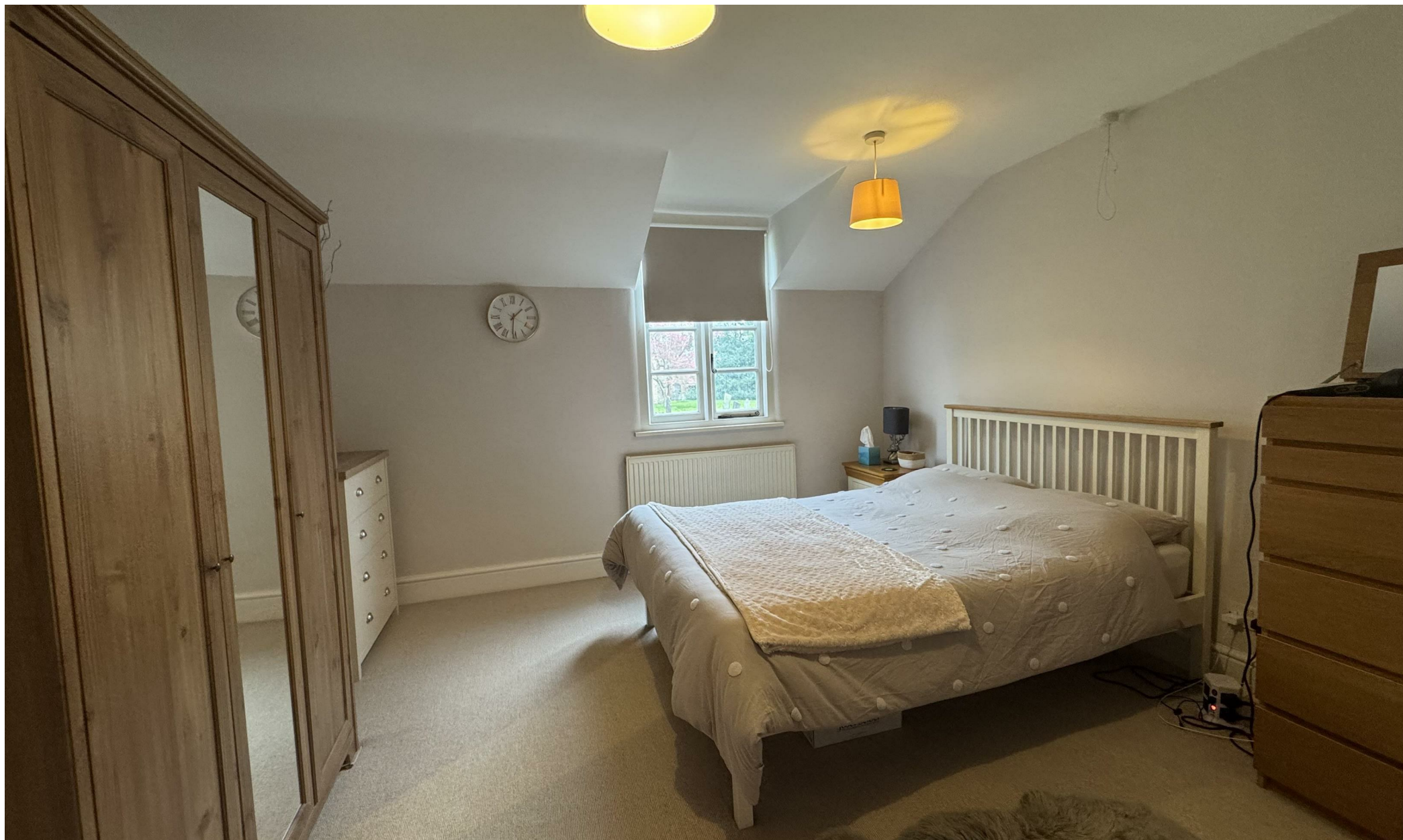
LUTTERWORTH | 12A MARKET STREET, LUTTERWORTH, LEICESTERSHIRE, LE17 4EH